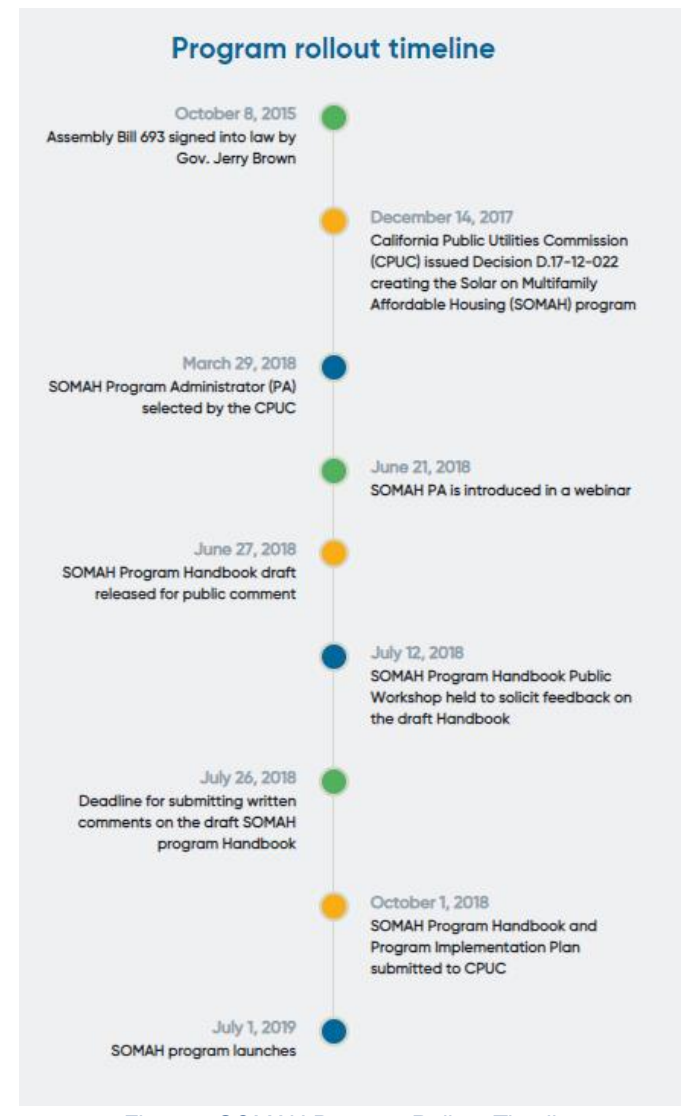
Figure 2 SOMAH Program Rollout Timeline

program to distinguish it from other state clean energy and low-income solar programs. Decision 17-12-022 established the program's budget, incentive structure and eligibility policies, among other items.